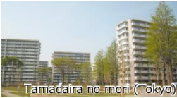
Tamadaira no mori (Tokyo)

In cooperation with local governments and private sectors, we implement urban revitalization projects of high policy significance, such as strengthening the international competitiveness of cities, revitalizing local cities, and developing and improving dense urban areas.