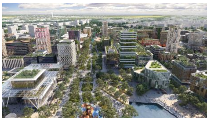
Artists impression provided by the Western Parkland City Authority, NSW Government (Australia)

We have exchanged memorandums with partner institutions around the world, including the NSW Government for Western Sydney, Australia, and the Ministry of Transport of Thailand and the State Railway of Thailand for Bang Sue, Thailand, to provide support through exchanging views and providing advice on planning for urban development.