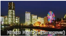
Minato Mirai 21 (Kanagawa)