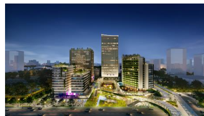
Artists impression of Bang Sue Project (Thailand)