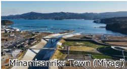
Minamisanniku Town (Miyagi)

Properly provide rental housing by planning, designing, constructing (reconstructing), maintaining, repairing and renovating approximately 700,000 rental housing units, and offer them at market rent.